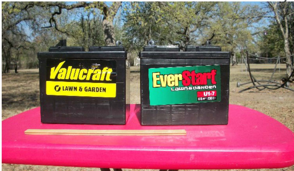
Suitable Internal Batteries (not included) Left – Auto Zone, Right – Walmart