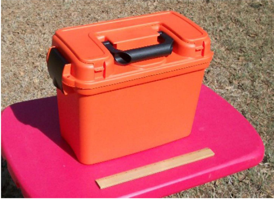
The Launch Controller