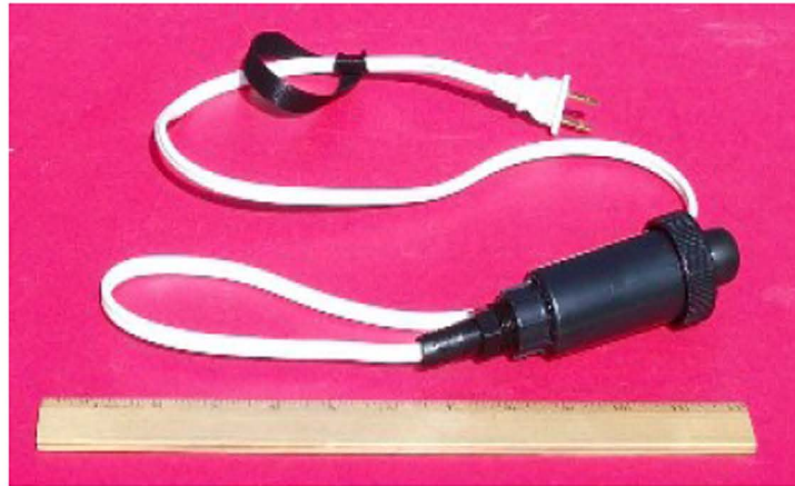
The Launch Button