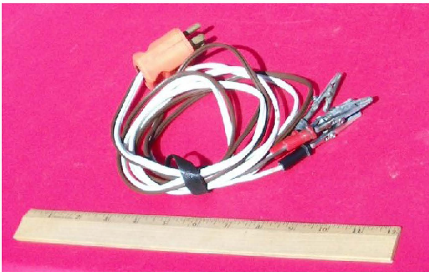
The Pad Cables with Alligator clips 2 sets are required for 4 pads