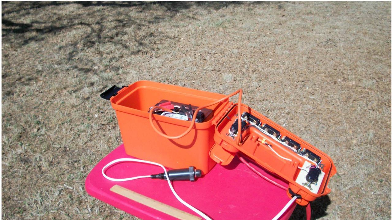
The Launch Controller connected to an internal lead acid battery